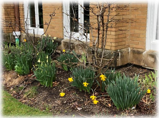
Our Daffodils Blooming